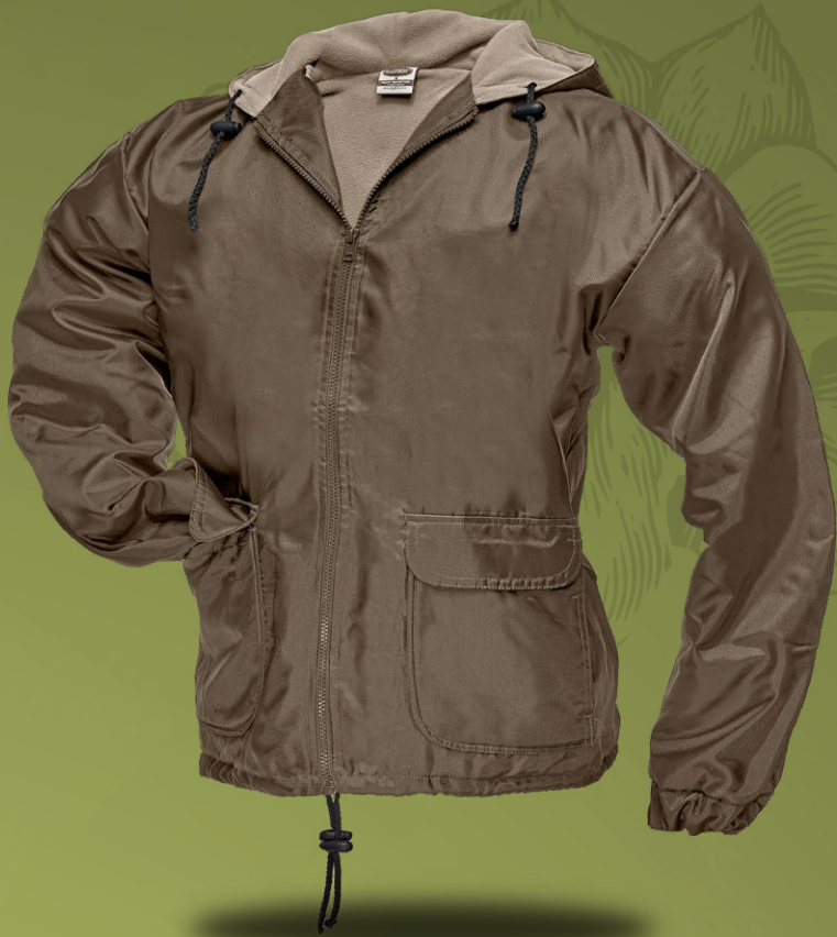
255F Knysna Fleece Lined & Water Resistant

A WATER RESISTANT FLEECE LINED jacket with drawstrings and hood for wet rainy conditions.