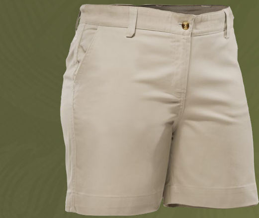
810 Tayla Jane Selengei

Form fitting shorts with side and back pockets made from COTTON-STRETCH FABRIC .