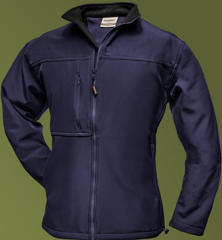
530 Pangolin Unisex Softshell

Lightweight, highly breathable, moisture managed treated softshell jacket. Made from LAMINATED POLYESTER with fleece lining.