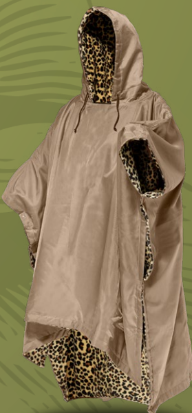
257 Fleece Lined & Water Resistant Poncho

A water-resistant poncho with fleece lining, a hood and drawstring at the neckline, Velcro at the sides.