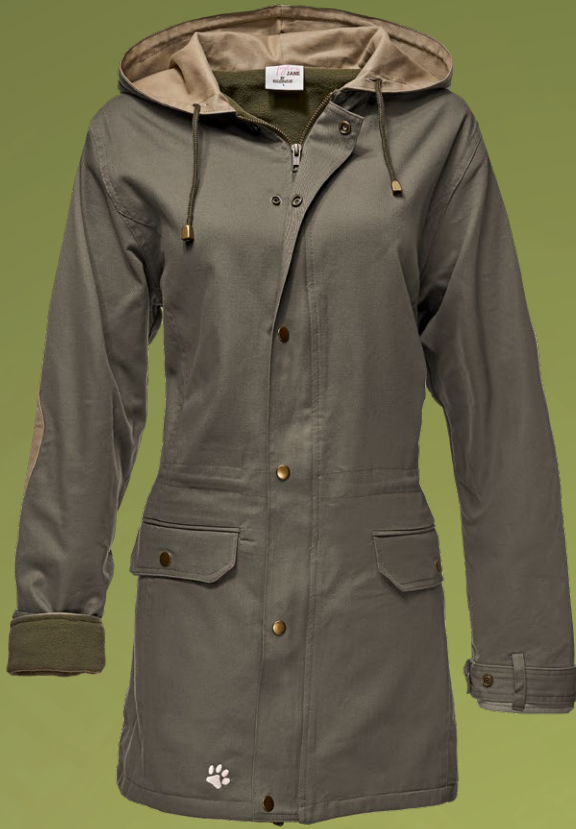
807 Tayla Jane Karula

Similar to the Bokmakierie with some extra detail finishes, this is a heavy weight, parka jacket. COTTON RICH EXTERIOR & FLEECE LINED. Full length zip, elbow patches, draw cord at waist, brass press studs with two pockets.