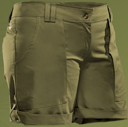
814 Tayla Jane Selous

Short with bellow pockets and button-up tabs for adjustable length. STRETCH RIPSTOP FABRIC . 98% Cotton/2% Spandex