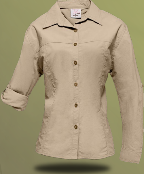
811 Tayla Jane Chakwenga

Form fitting, NYLON RIPSTOP fabric blouse, with button-up tab on the sleeves. Easy wearing and quick drying.