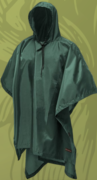
175 Water Resistant Poncho

A lightweight water-resistant poncho with a hood, drawstring at the neckline, Velcro at the sides.