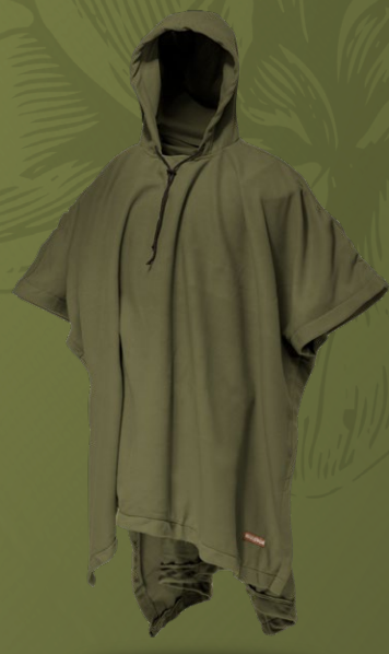
256 Polar Fleece Poncho

A hooded anti-pill polar fleece poncho for winter