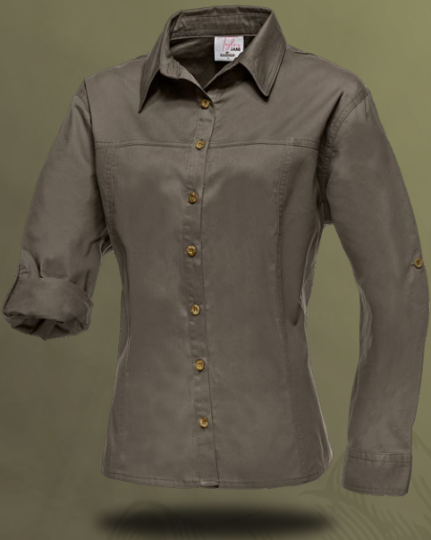
813 Tayla Jane Mpata

EASY-WEARING FORM FITTING , long sleeve blouse made from 100% Cotton fabric, with button-up tab on the sleeves.